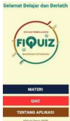
Figure 1 is a view of the main menu of the application, this view displays the menu in the fiqh quiz application, which consists of three buttons, namely Material, Quiz and About Application. Students can choose one of the tools in this application menu in learning according to the teacher's direction.