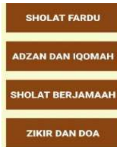
Figure 2 Display Menu Select Material

Figure 2 is the display of the select material menu, this display contains a selection of materials that can be studied before the user answers the questions in the quiz menu. Teachers can be easy in the learning process because students