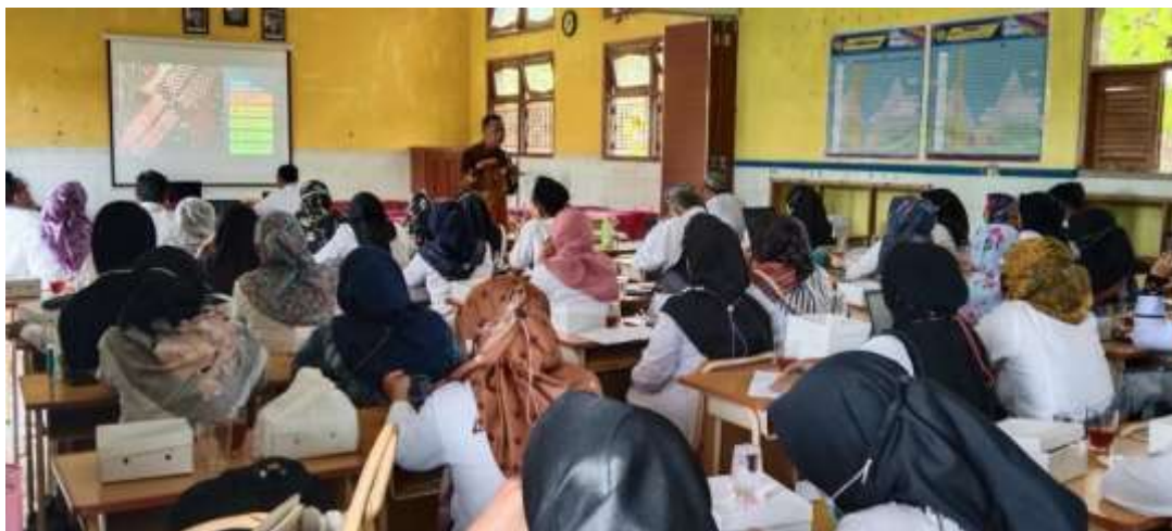
Figure 2. The speaker conveys the learning concept material.