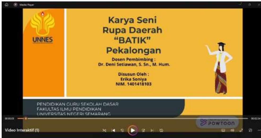
Figure 4. Screen display of one of the learning video products made with the Powtoon application.