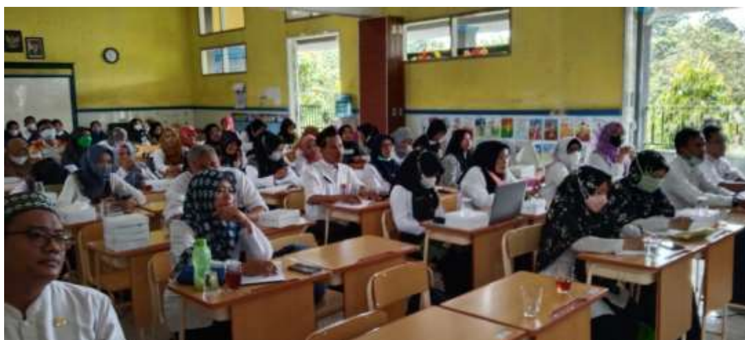
Figure 3. The teachers listened to the speaker's explanation.